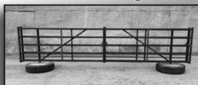
Compact & Mobile