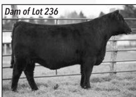
Dam of Lot 236

One of the hot- test bulls in the breed for his ex- cellent calving ease and high customer satis- faction. 316 did an excellent job on heifers; they were born small and grew quite well. The females he left out of our first calf heifers look outstanding. Excellent calving ease option for heifers.