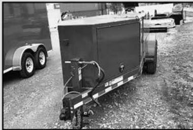
Farm Boss 990 Fuel Trailer