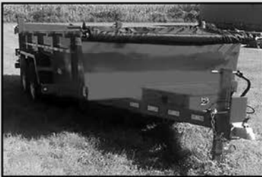
B-B Dump Trailers

DESIGN YOUR OWN TRAILER! ~ PLUS ~ FARM EQUIPMENT – TILT – CARGO – DUMPS – FLAT DECK