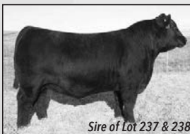
Sire of Lot 237 & 238

These Quarter- back bulls are stout made and grow. His dam was selected by Schafer Angus as a feature in our female sale where we sold a partial em- bryo interest. Excellent calving ease option for heifers.