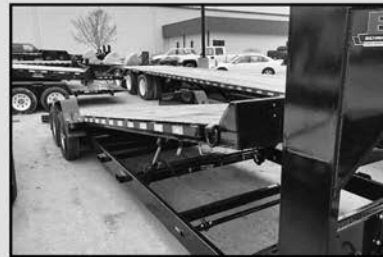
B-B GN Full Tilt Flatbed Trailer