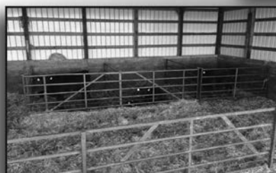
Perfect for Calving Season