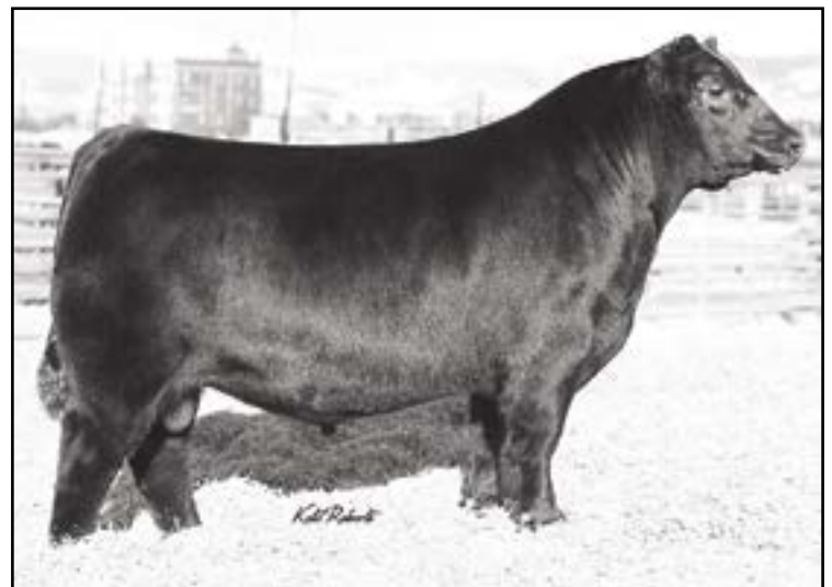
Musgrave Sky High 1535 Sire of Lot 44