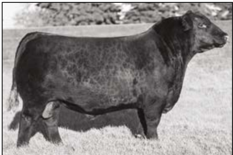
KJHT Power Take Off 2070 Sire of Lot 16

This son of KJHT Power Take Off, who was 9 months old when he was crowned National champion at NAILE in 2015, did the job when he was on test. He will also get the job done on pasture as well. This bull has an exceptional set of wheels underneath him and will be able to cover a number of cows this spring. He was on the higher end of ADG Ratio with a 105. This is no surprise when he ranks in the top 9% in YW EPD and top 5% in ADG EPD.