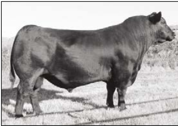
Hoover No Doubt Paternal Grand Sire of Lots 47, 49 & 50