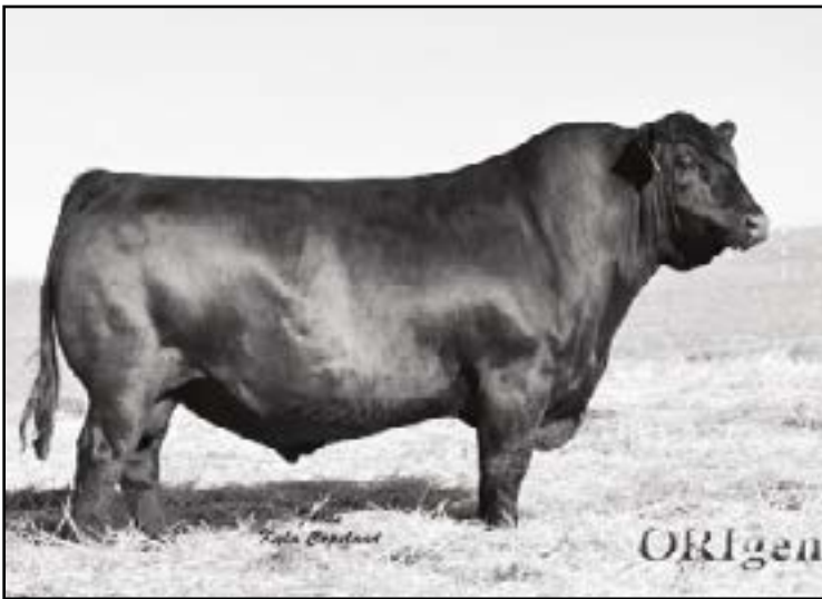
Basin Payweight 1682 Paternal Grand Sire of Lots 4 & 6