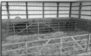
Perfect for Calving Season