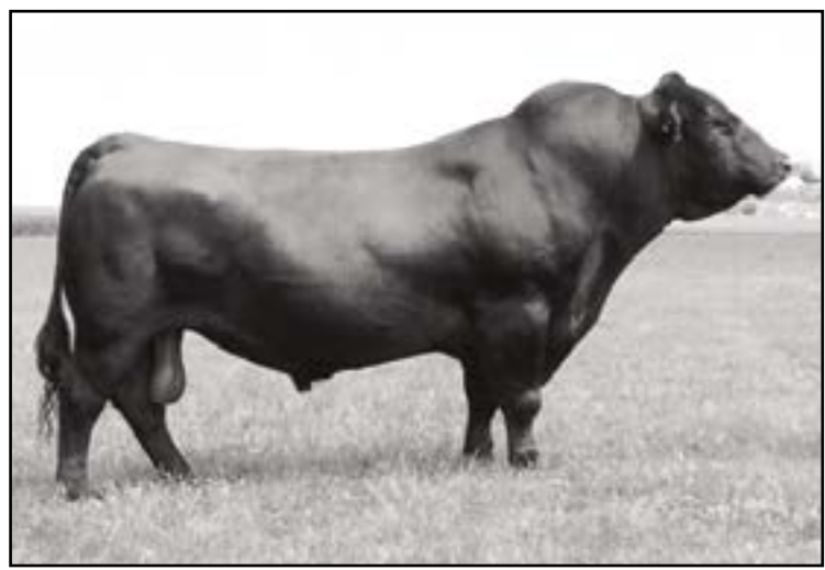
Quaker Hill Rampage 0A36 Paternal Grand Sire of Lot 11