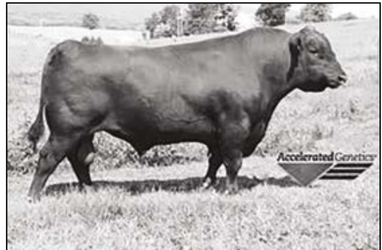
POSS Total Impact 745 Paternal Grand Sire of Lot 5