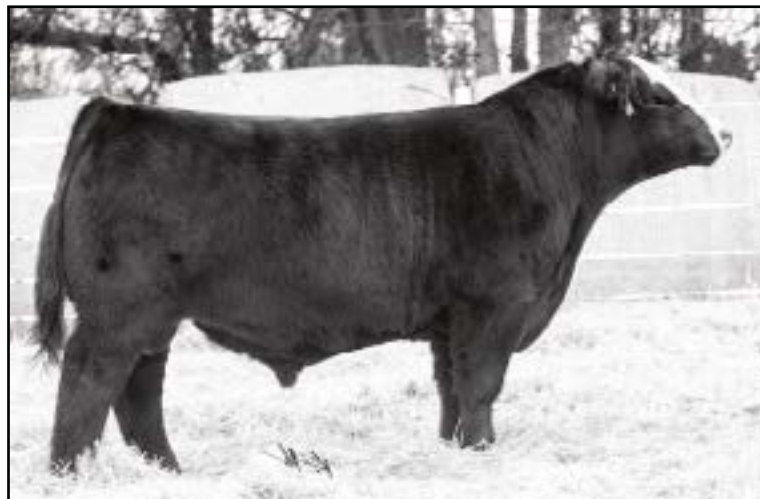
SK Smooth Criminal H76 Sire to Lot 73

SimGenetics PROFIT THROUGH SCIENCE American Simmental Association