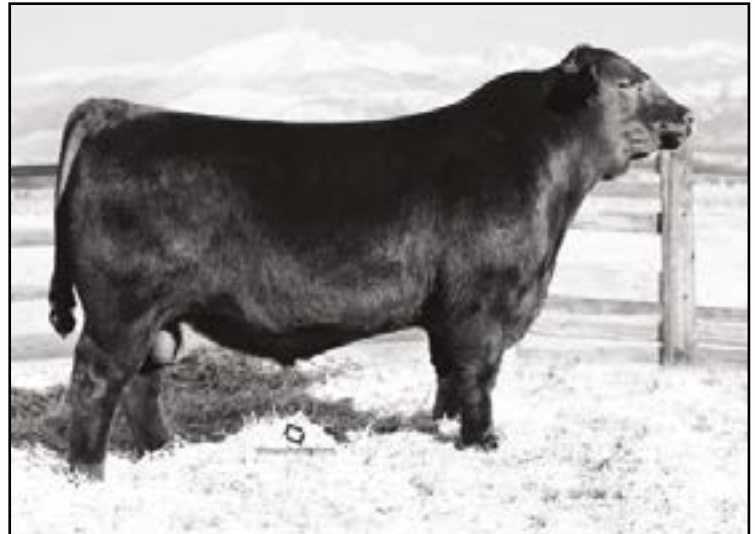
Byergo Boomer 6351 Sire of Lot 35