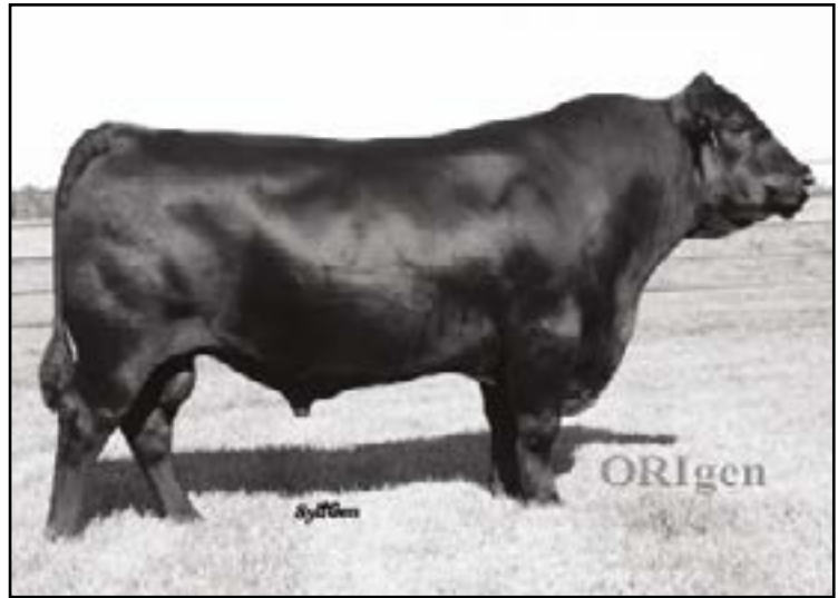
SydGen Black Pearl 2006 Maternal Grand Sire of Lot 19

This grandson of AAR Ten X, combines a balanced, commercial cattlemen's pedigree that we are sure you will like. With an exceptional YW and terminal index profile, focus in on this bull if you retain ownership on your calves. This bull is branded CAB and can assist you in better premiums on the rail in calf crops to come. He finished the test with an ADG Ratio of 114, and ranks in the top 3% in %F and top 5% in $B.