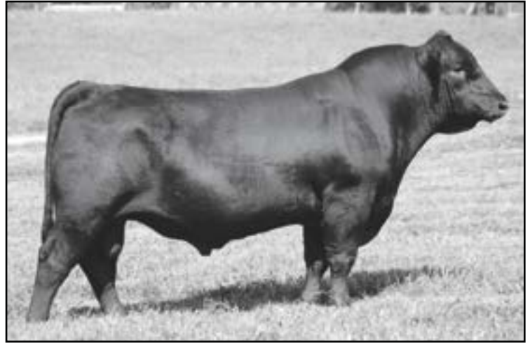
Byergo Black Magic 3348 Sire of Lots 1, 2 & 3.

Note that this dam is from the Blackbird Cow Family with super performance and maternal EPD's. Mate her with the renowned performance sire Byergo Black Magic 3348. You then have a calf with a final ADG Ratio of 124 and ranks in the top 1% of $B, $C, & $F. May I also point out, he is in the top 5% YW and RE.