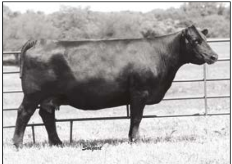
Byergo Miss Cupcake 7400 Paternal Grand Dam of Lot 36