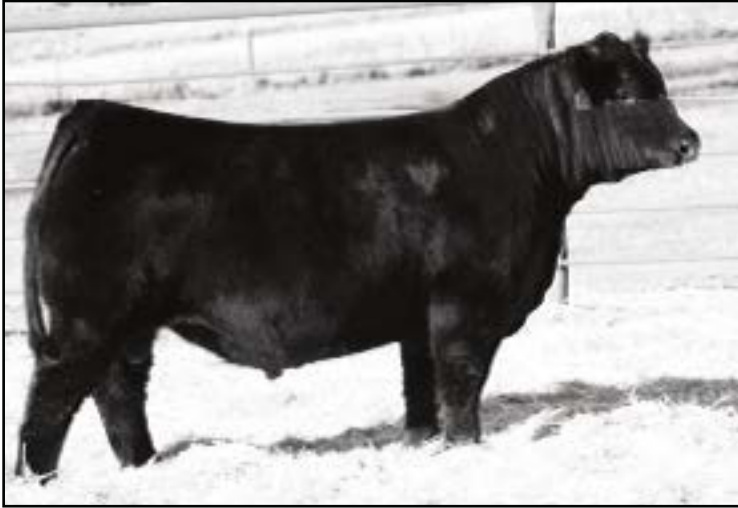
W/S Night Watch 84E Sire of Lot 58