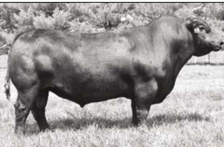
LD Capitalist 316 Sire of Lot 41