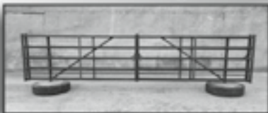
Compact & Mobile