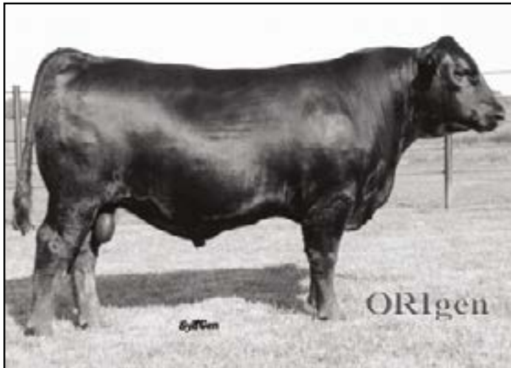
SydGen Destiny 5393 Sire of Lots 8 & 10