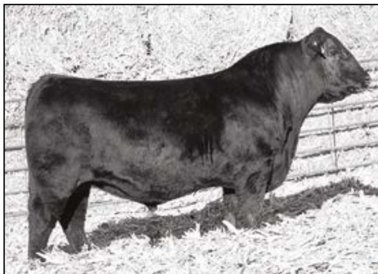
Jindra Perfection Sire of Lot 55