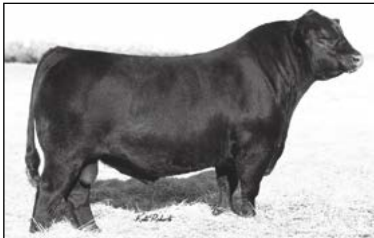
KR Synergy Sire of Lot 43

This calving ease bull by KR Synergy and a HA Cowboy Up 5405 dam has a +13 CED, +15 CEM & a -2 BW. "Synergy" is ultra-correct, square, and attractive in his design with top EPD percentile ranks in nearly all traits! His final ADG of 3.67, Ratio 108 indicates good growth along with his calving ease, so he's a "sleep all night" and sit back & watch them grow bull kind of bulls. The Lady Blackbird cow family has been a backbone of our herd and adds muscle, rib, shape, good feet, and longevity. RECOMMENDED FOR HEIFERS or COWS!