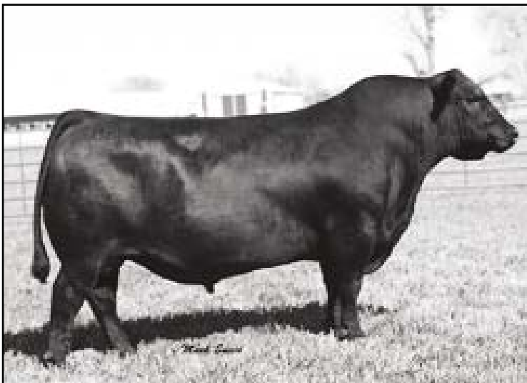
Boyd Gun Powder 2070 Sire of Lot 18