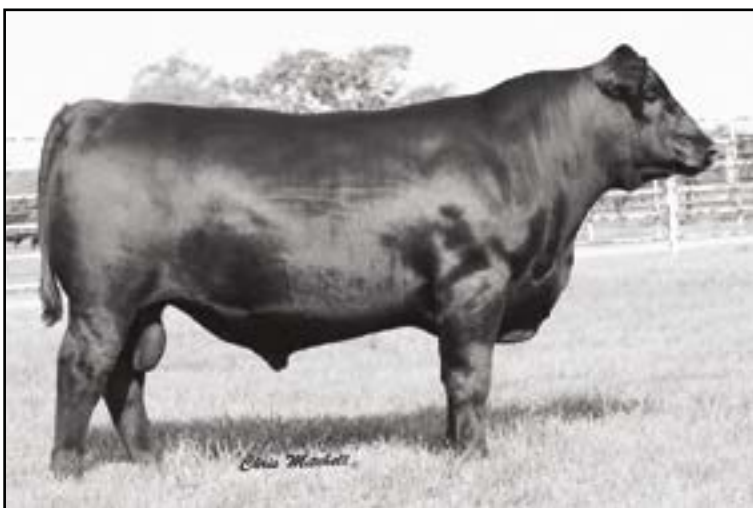
Deer Valley All In Paternal Grand Sire of Lot 12

Here is one with a little more frame that would be a good fit for those bigger cows. With a 71 lb. birth weight, he will also work on heifers. Of our fall bulls he had the top weaning weight, and finished the test with a WDA of 105.