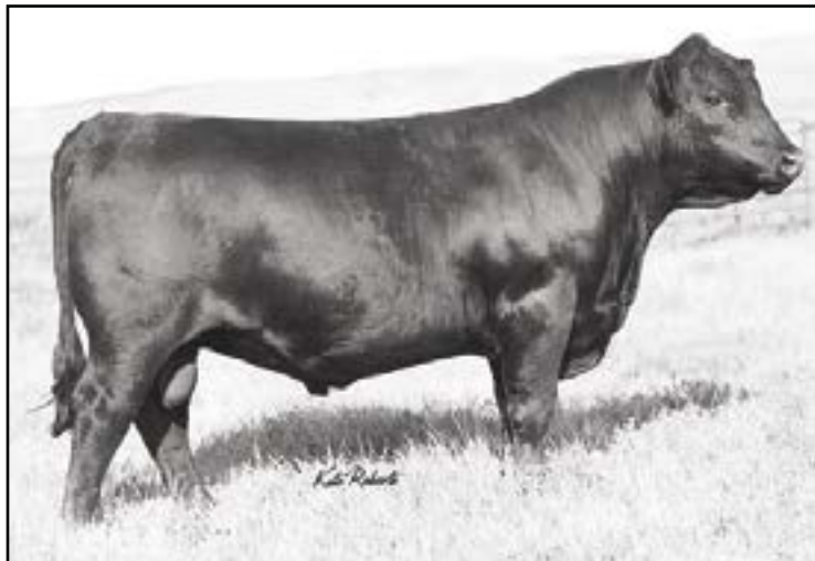
Byergo Titus 6340 Sire of Lot 37

Here's a dandy feature from Byergo Titus 6340. RV Trogan 0377 is a low birth, calving ease bull who also possesses terminal qualities. He stands square on four corners, and has that herd bull presence that really grabs your attention. He stands in the Top 1% for $M, top 5% for $W, top 10% for WW, and Top 15% for $C. His dam heirs from the great Byergo Andy 0115 and is really long bodied, good footed, and packs a level tight udder. Trogan will work great on heifers and cows, but won't give up any performance.