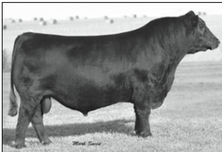
Kramers Apollo 317 Paternal Grand sire of Lot 61