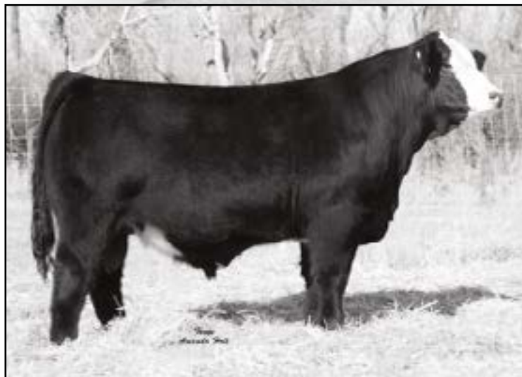
Kappes Big Ticket C521 Sire to Lot 72